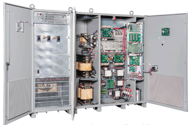
5000 Series 3P1 - 50 kVA with MBS + SKRU & Bypass Input ISO Transformer Option