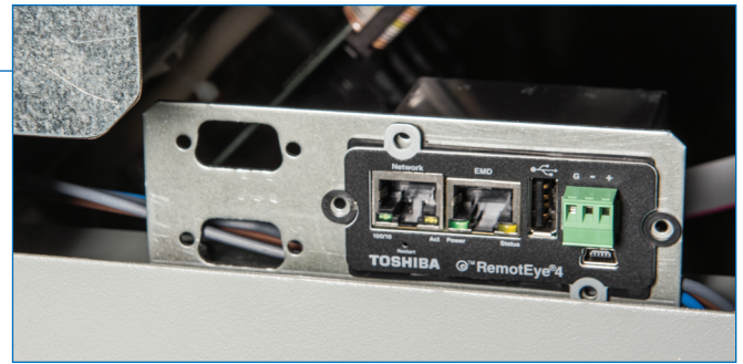
Toshiba RemotEye® 4 Monitoring Card