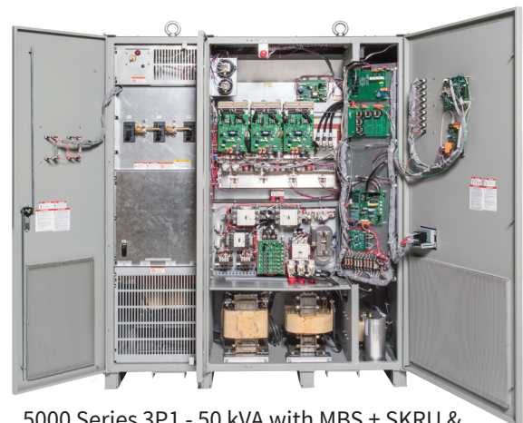
5000 Series 3P1 - 50 kVA with MBS + SKRU & Bypass Input ISO Transformer Option