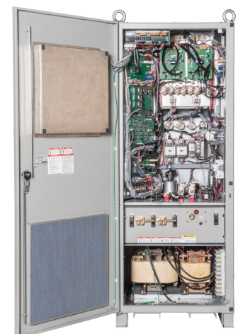
5000 Series 3P1 15 kVA