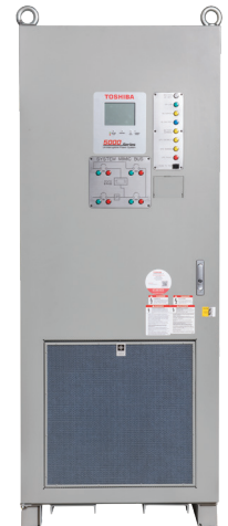
5000 Series 3P1 - 15 kVA