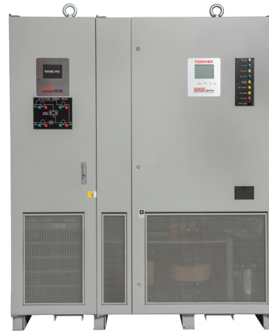
5000 Series 3P1 - 30 kVA

Toshiba's 5000 Series 3P1 UPS is a reliable solution for 3-phase input and 1-phase output back-up power configuration for industrial-grade applications. Built in Houston, the 3P1 is a double conversion UPS and comes with a standard 3 year warranty. The 3P1 Solution is designed to push the boundaries of UPS performance standards in petrochemical, oil and gas refineries, mining, and wastewater applications. Wave Capture is a built-in feature that aids in troubleshooting by capturing and storing voltage and current waveforms at input, output, DC bus, and DC battery link along with a time stamp. All Toshiba 5000 Series models feature industrial rated components designed for a 20-year life span.